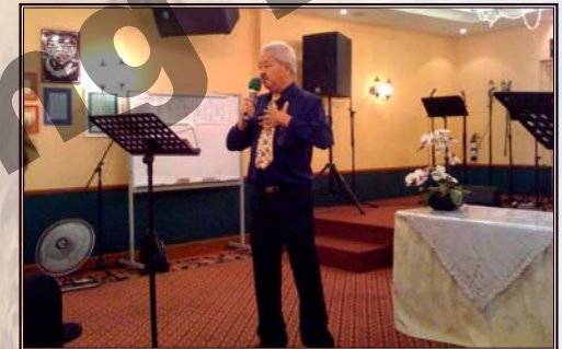
"The Spirit of God Delivers the Message of God I Love You"